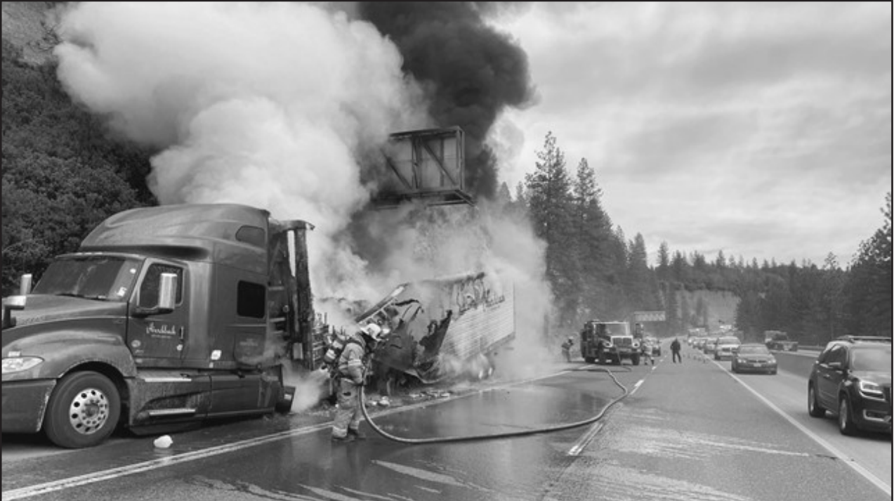
Big rig fire on I-80 at Gold Run on May 9, 2021