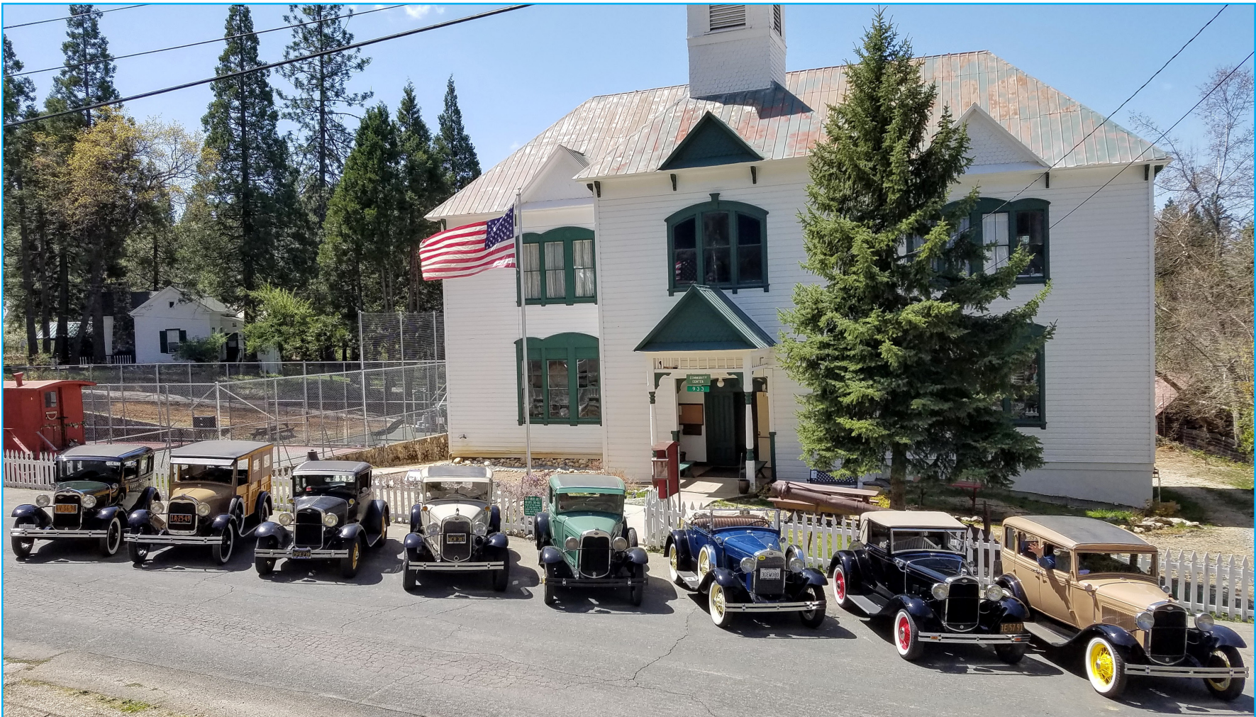
Auburn A’s Model A Ford Club