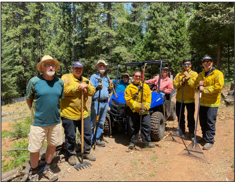
Volunteers at the annual Dutch Flat cemetery clean up on June 5, 2021