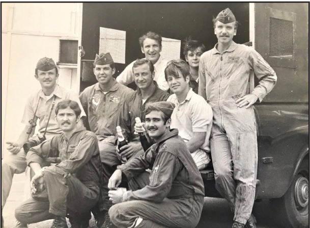
“Nursery” Crew of pilots and navigators, Viet Nam, 1972