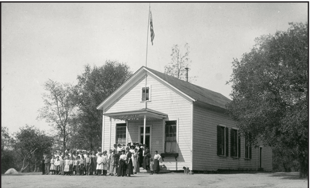
Fruitvale School in Lincoln