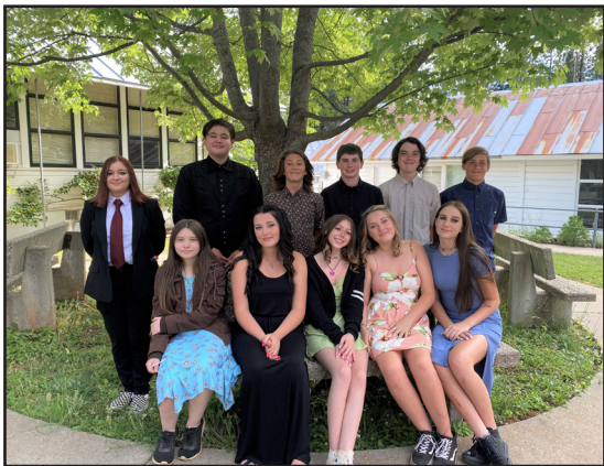
ADFS 2021 8th Grade Graduates