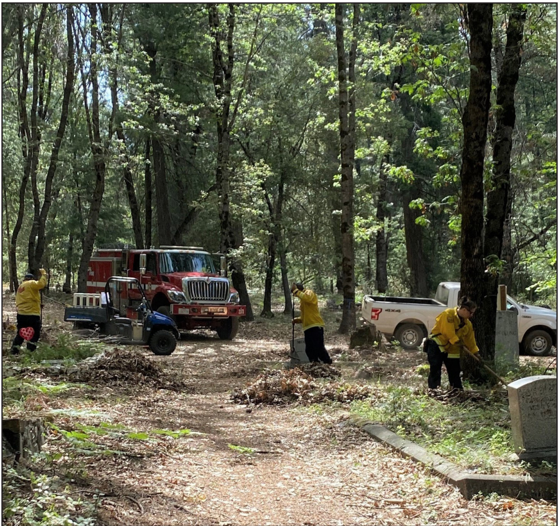
CALFIRE Nevada-Yuba-Placer Unit, stationed in Alta, also donated resources to the cemetery clean up effort