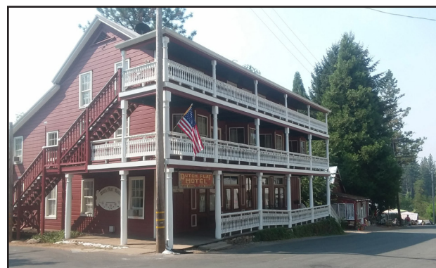
The Dutch Flat Hotel